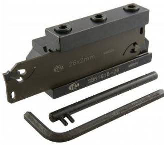
L466 Professional Lathe Parting Tool Kit - Insert Type