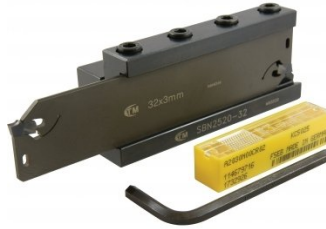
L467 Professional Lathe Parting Tool Kit - Insert Type