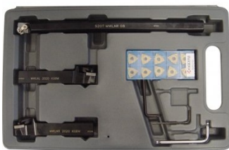
L452 Lathe Turning Tool Kit - 3 piece Insert Type