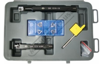
L456 Lathe Threading Tool Kit - Insert Type