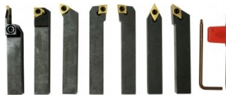
L0077 Lathe Turning Tool Kit - 7 piece Insert Type