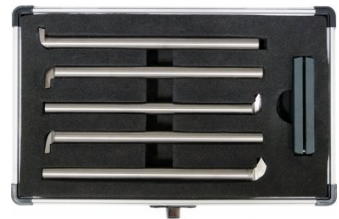
L006A Boring Bar Set - HSS