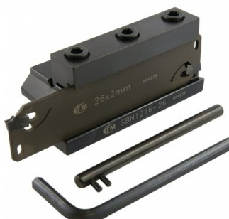
L464 Professional Lathe Parting Tool Kit - Insert Type