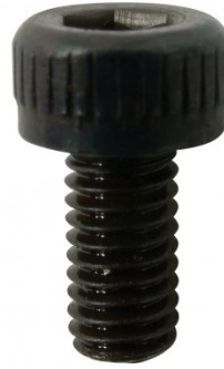
L540 Screw Seat to Suit Threading Tool Holders