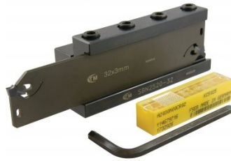
L467 Professional Lathe Parting Tool Kit - Insert Type