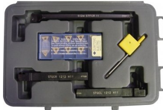
L450 Lathe Turning Tool Kit - 3 piece Insert Type