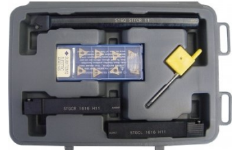
L451 Lathe Turning Tool Kit - 3 piece Insert Type