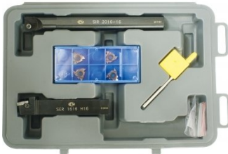
L457 Lathe Threading Tool Kit - Insert Type