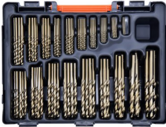
D126 Metric 135° Precision HSS Drill Set - 170 Pieces