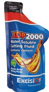
S090A Soluble Metal Cutting Fluid - 1 Litre