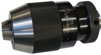
C294 Industrial Drill Chuck - Keyless Type