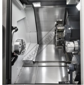
LYNX 2600SY Inside