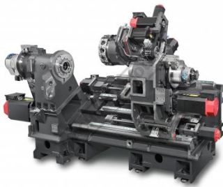
LYNX 2600SY Insert 2