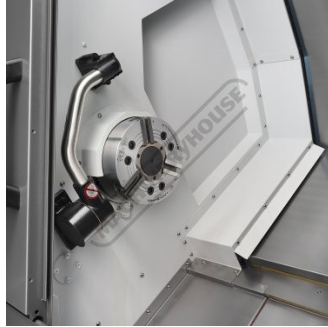
LYNX 2600Y Inside