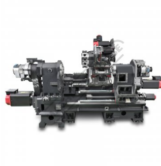
LYNX 2600Y Insert