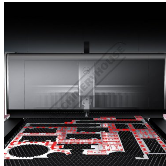
Intelligent remnant layout