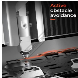
Active obstacle avoidance