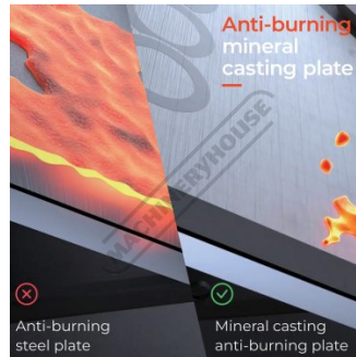
Anti burning mineral casting plate