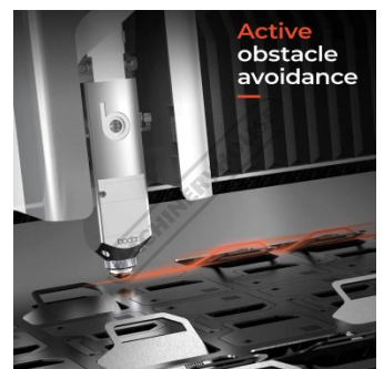
Active obstacle avoidance