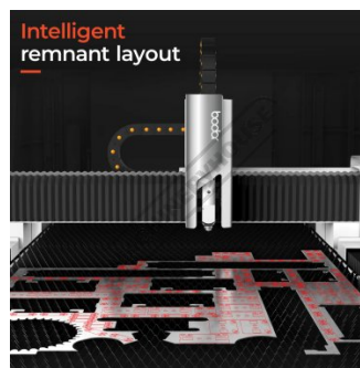
Intelligent remnant layout