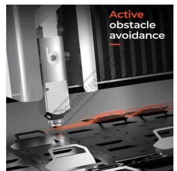
Active obstacle avoidance