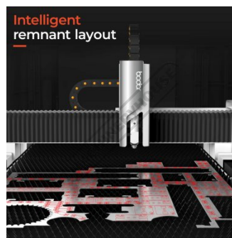
Intelligent remnant layout