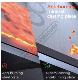
Anti burning mineral casting plate