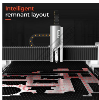
Intelligent remnant layout