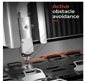
Active obstacle avoidance