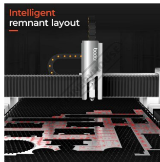
Intelligent remnant layout