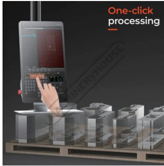
One click processing