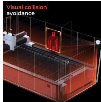
Visual collision avoidance