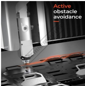
Active obstacle avoidance