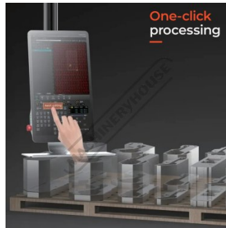
One click processing