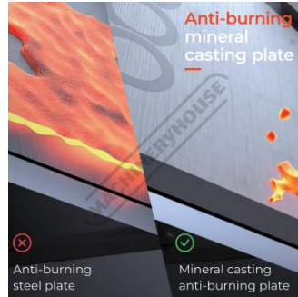
Anti burning mineral casting plate