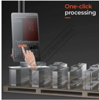
One click processing