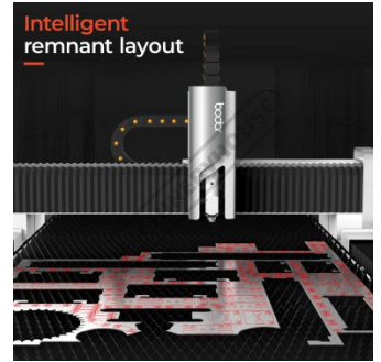
Intelligent remnant layout