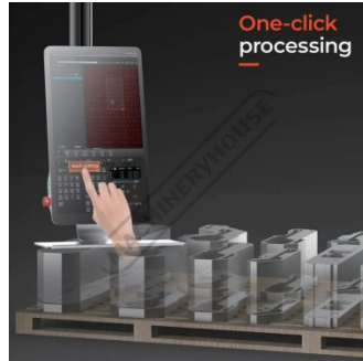
One click processing