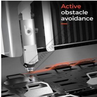
Active obstacle avoidance