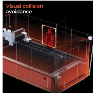
Visual collision avoidance