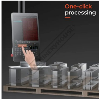
One click processing