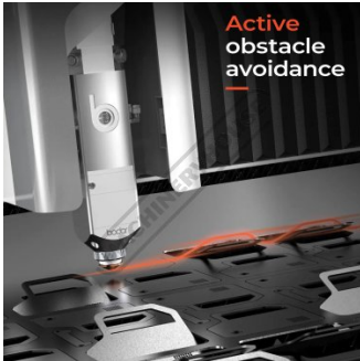
Active obstacle avoidance