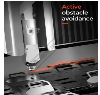
Active obstacle avoidance