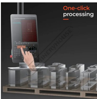
One click processing