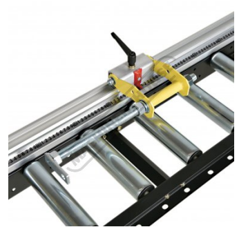
Shown In Stop Position