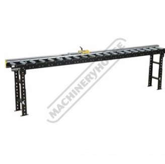
Shown With Optional Roller Conveyor