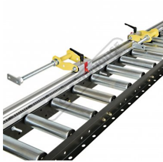
Shown With Optional Length Stop