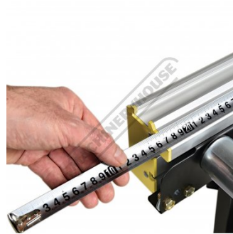
Measuring Scale Insert