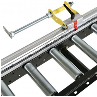
Shown In Open Position