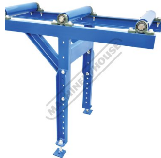
Height Adjustable Legs