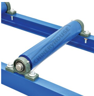
Heavy Duty Ball Bearing Rollers with Grease Nipples