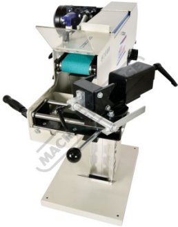
Swivel Vice From 30 90