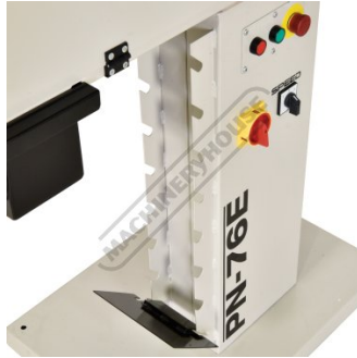
Rack For Roller Storage