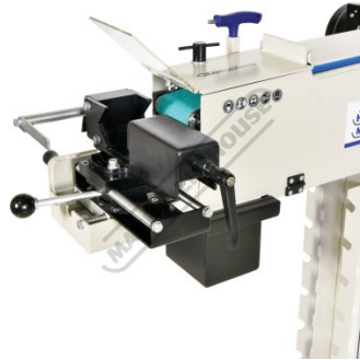
Quick Action Compound Vice