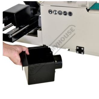
Removable Front Dust Tray