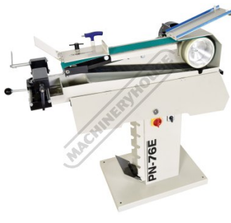
Quick Change Belt System