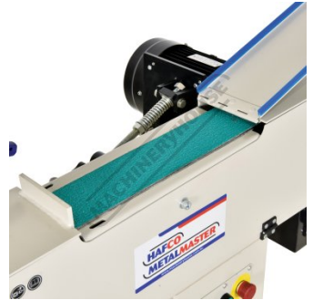
Top Station For Flat Lining Deburring