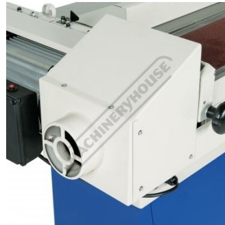
Rear Dust Extraction Port