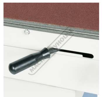
Quick Action Belt Tension Lever