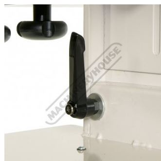
Belt Angle Tilt Lever Lock