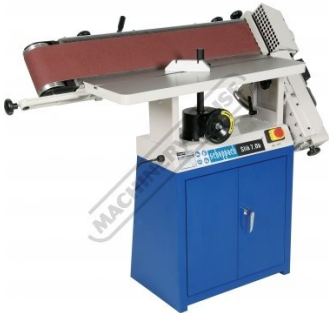
Tilting Sanding Belt 90-180 Degrees