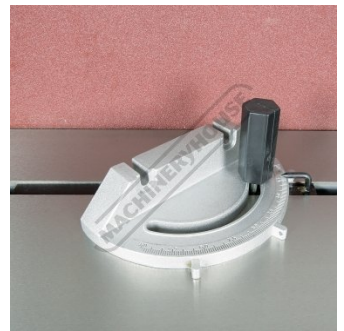
Mitre Guide Scale