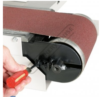
Belt Tracking Adjustment