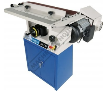
Table Guide Support Rear View