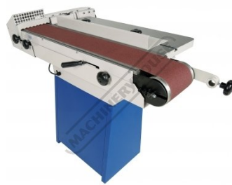
Table Guide Support