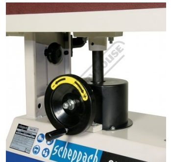
Table Height Adjustment Handle