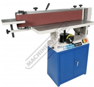
Table Height Lowest Position