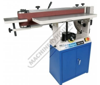
Adjustable Table Height