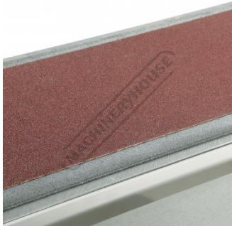
Graphite Belt Pad