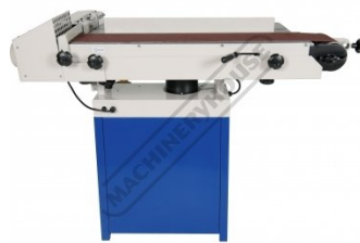
Side View of Belt