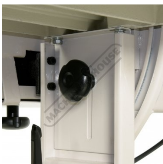
Table Height Locking Knob