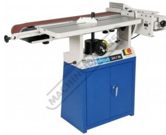
Horizontal Sanding Belt Position