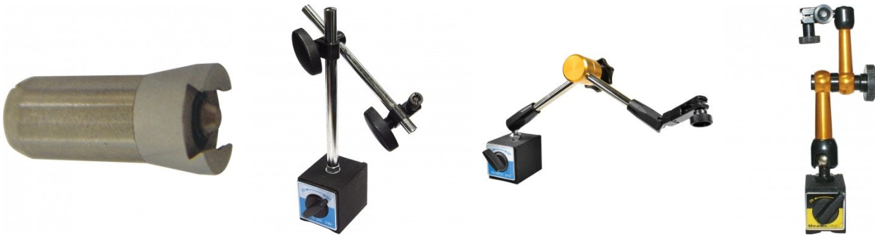
Q430 Magnetic Base - Small