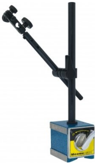
Q435 Magnetic Base - Large