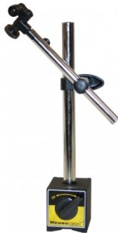
Q4351 Magnetic Base - Large