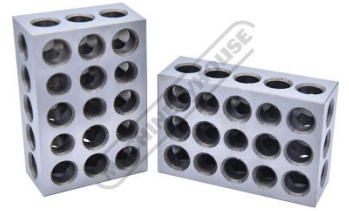
Set View 2