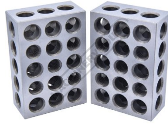
Set View 1