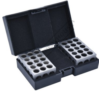
Shown in Case