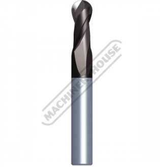
Flute Ball Nose