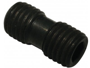
ML115 Cutter Part - Screw