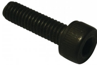
ML110 Cutter Part - Locator Screw