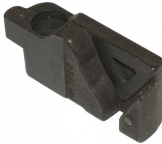
ML114 Cutter Part - Locator