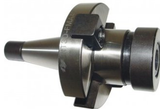
M545 Face Mill Arbor