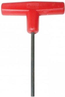
ML410 Cutter Part - Key