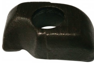
ML200 Cutter Part - Clamp