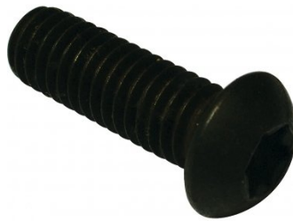
ML100 Cutter Part - Screw