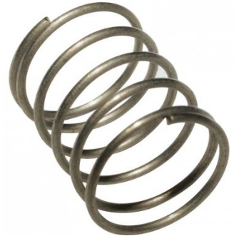
ML300 Cutter Part - Spring