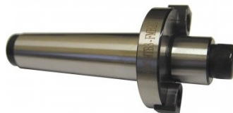
M562 Face Mill Arbor