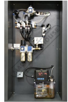
Auto Lubrication and Air Filter