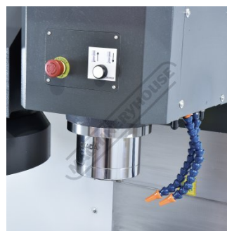
Spindle and Controls