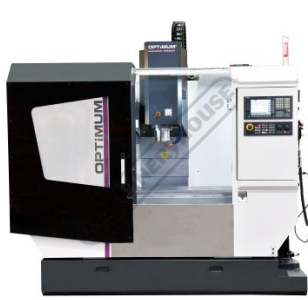
Front View Door Open