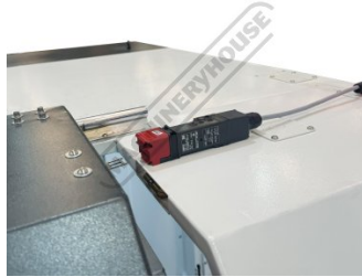
Micro on Front Door