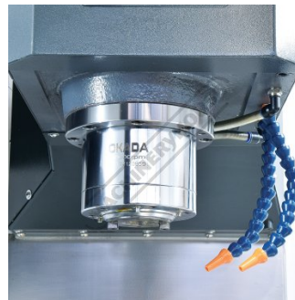
Spindle with Coolant Hoses