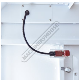
Micros on Doors