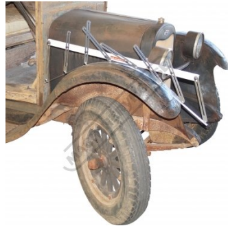
Shown On Truck Single Curve