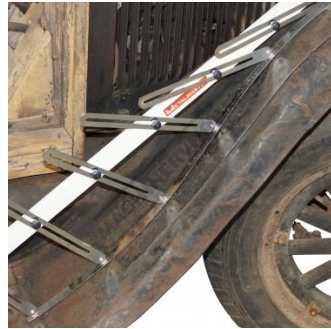
Truck Panel Close Up