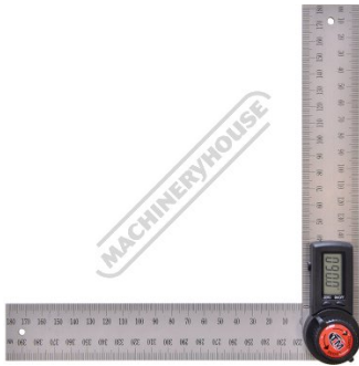
90 Degree View