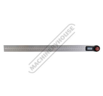
zero degree view