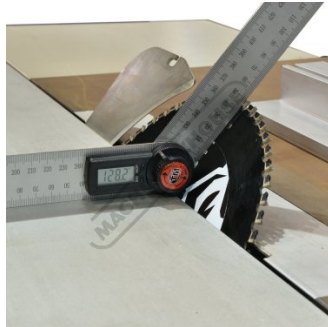
Shown Measuring Blade Angle