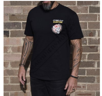
Make it Kustom