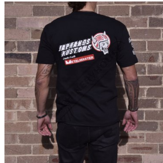
Create It with Metalmaster