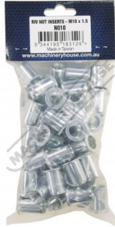
Packaging Rear Side