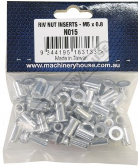
Packaging Rear View