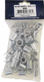
Packaging Rear Side