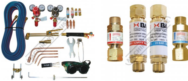
Oxygen Acetylene Gas Kit Contents Flash Back Arrestors