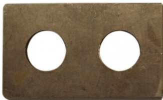
P204A Round Die - Ø4.2mm