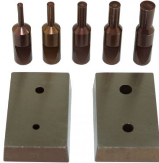
P202 Round Punch & Die Set - Ø3, Ø4, Ø5, Ø6 & Ø8mm