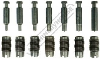
Includes Punch And Dies