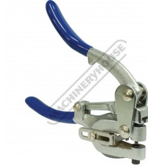
Hole Punch Tool