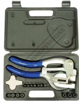
Shown in Case