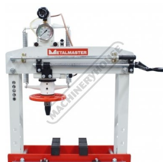
Adjustable Horizontal Ram Left