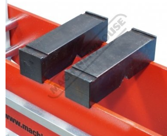
Vee Blocks Reverse Side