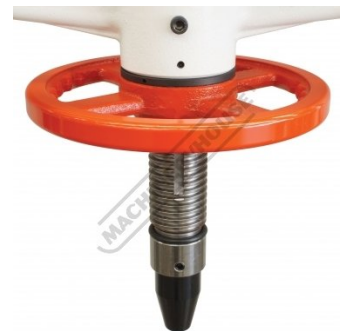
Rapid Approach Hand Wheel