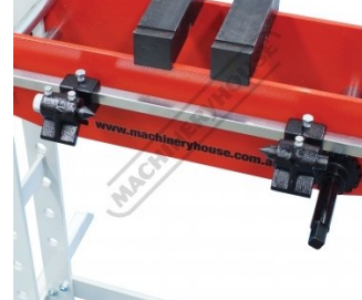
Centres for Shaft Straightening