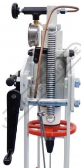
Spring Return on Ram