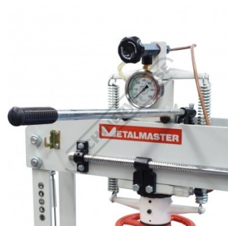
Handle to Operation Ram