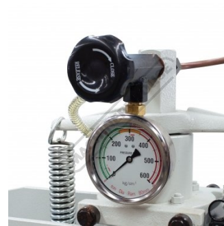
Ram Release Dial