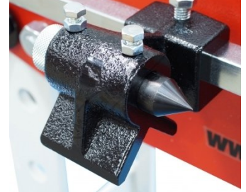
Centres for Shaft Straightening Close Up