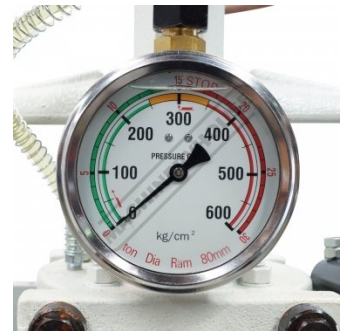
Oil Filled Pressure Gauge