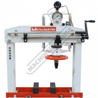
Adjustable Horizontal Ram Right