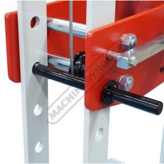
Table Height Pins