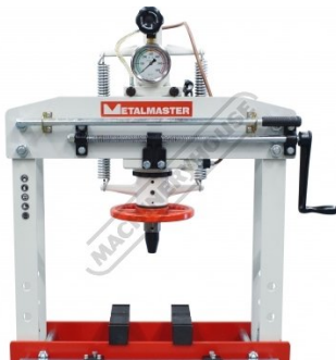
Adjustable Horizontal Ram Centre