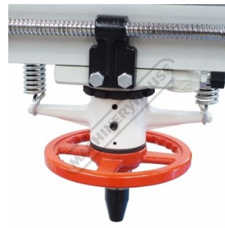
Quick Action Hand-Wheel for Rapid Approach