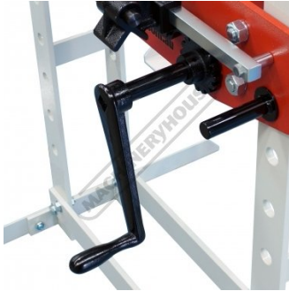
Table Winch Handle