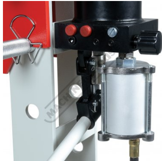
Hydraulic Pneumatic Hand Pump