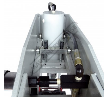
Ram Top View With Bearing Slide