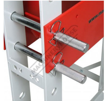
Table Pins With Safety Clips