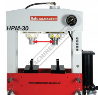
Horizontal Sliding Ram