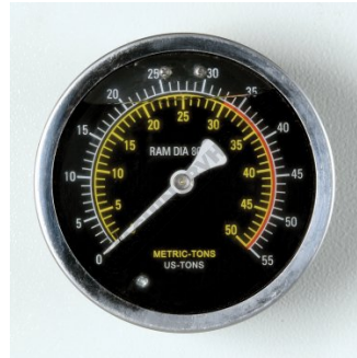
Metric / Imperial Pressure Gauge