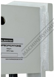
Robotic Welded Frame