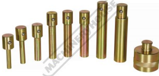
Pin Set & Adaptor