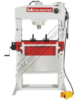
Shown in Down Position on Press