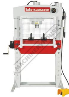
Shown in Up Position on Press