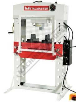
Guard in Up Position Fitted on Press