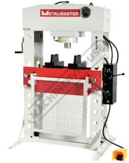
Guard in Down Position Fitted on Press