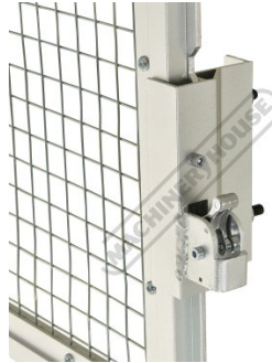
Side Lever Locks