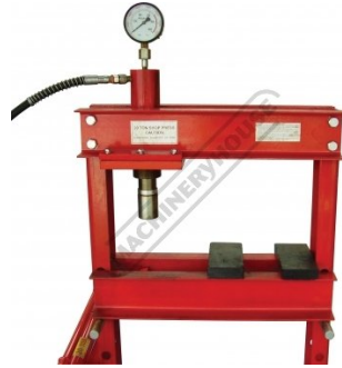
Ram Slide to the Left