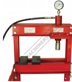
Ram Slide to the Right