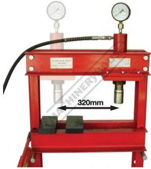
320mm Travel between Ram Centre