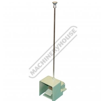
Roving Foot Pedal