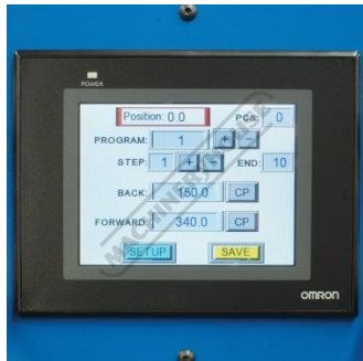
Touch Screen NC Control