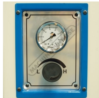
Pressure Adjustment Dial and Gauge