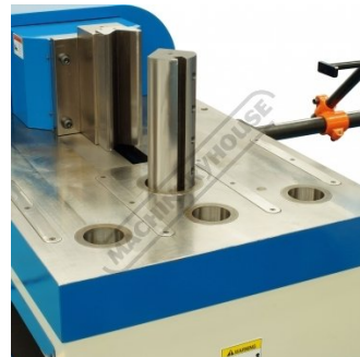
Table with Posts Removed for Optional Attachments