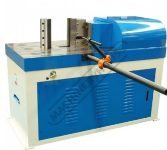
1000mm Manual Backgauge