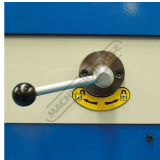
Main Post Release Lock Lever