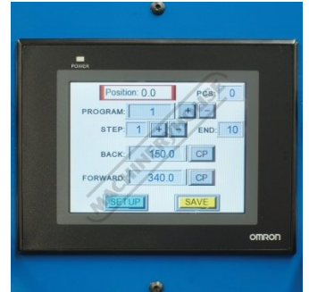
Touch Screen NC Control