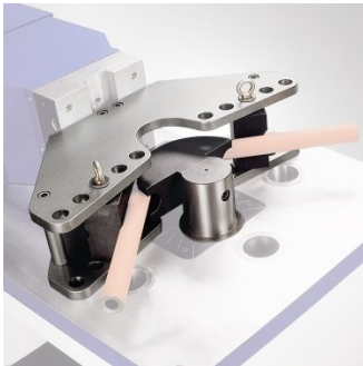
P1601 Pipe Bender Attachment