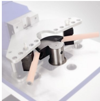
P1602 3/8" Pipe Bender Former Set