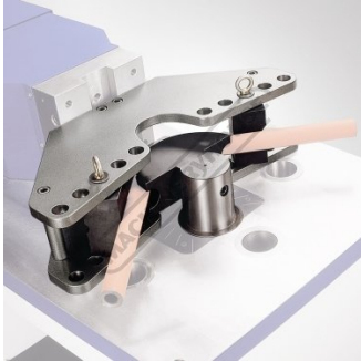
Shown with Pipe Bender Attachment