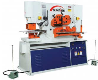
P176H Hydraulic Punch & Shear - 100 Tonne