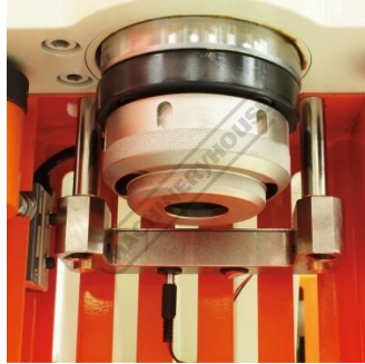
Fitted To Machine