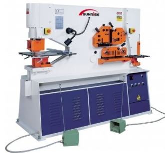
P177A Hydraulic Punch & Shear - 125 Tonne