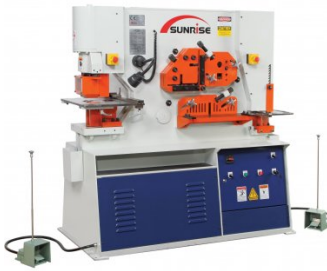
P176 Hydraulic Punch & Shear - 100 Tonne