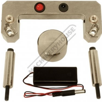
Laser Guide System