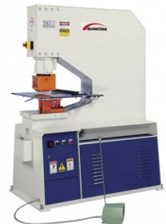
P192 Punching Machine