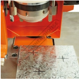
Laser Line On Galvanised Steel