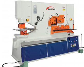
P178H Hydraulic Punch & Shear - 165 Tonne