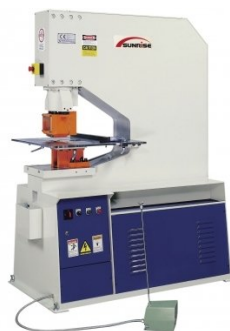
P194 Punching Machine