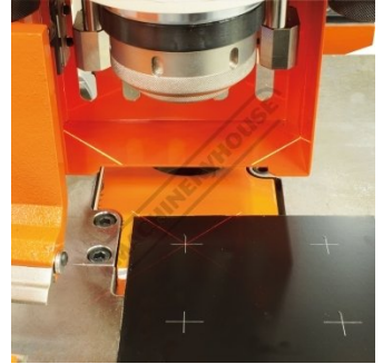
Laser Liner On Painted Steel