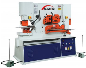
P177H Hydraulic Punch & Shear - 125 Tonne