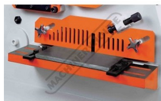
Flat Bar Shear