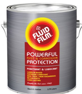
O044 Rust & Corrosion Preventive